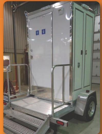
Optional trailer available